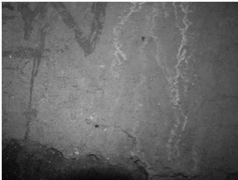
Figure 2 Loculus closure in the Villa Torlonia Catacomb, consisting of a tuff blocks kept in place with mortar. Its exposed surface, plastered by a thin, smooth, whitish layer of fine mortar, shows remnants of a red colored funerary inscription.